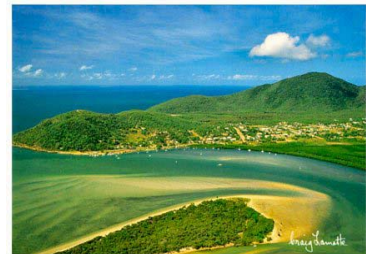
2. Cooktown, looking East - Grassy Hill on the left

A once in a lifetime opportunity to purchase this historic landmark "Grassy Hill". Two buildings, one facing south and the other north on 4.22 acres of historical significance. $2.4m